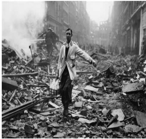
The milkman carried on with his deliveries