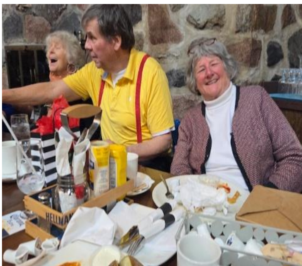
All's well that ends well.