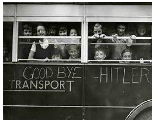
The children were evacuated