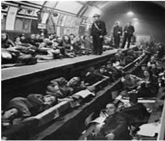
Londoners slept in the underground

W.W.2 ENDED MAY 8 TH 1945 - 80 YEARS AGO-AFTER 6 LONG YEARS