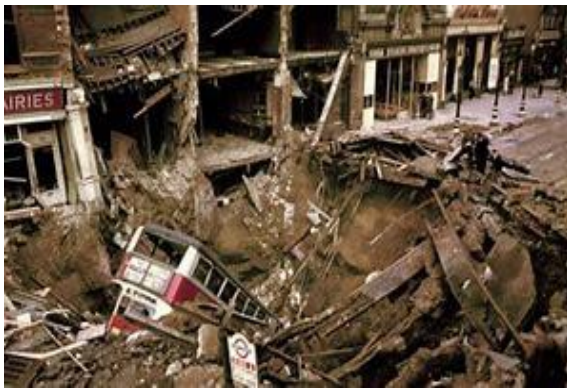
The damage was great