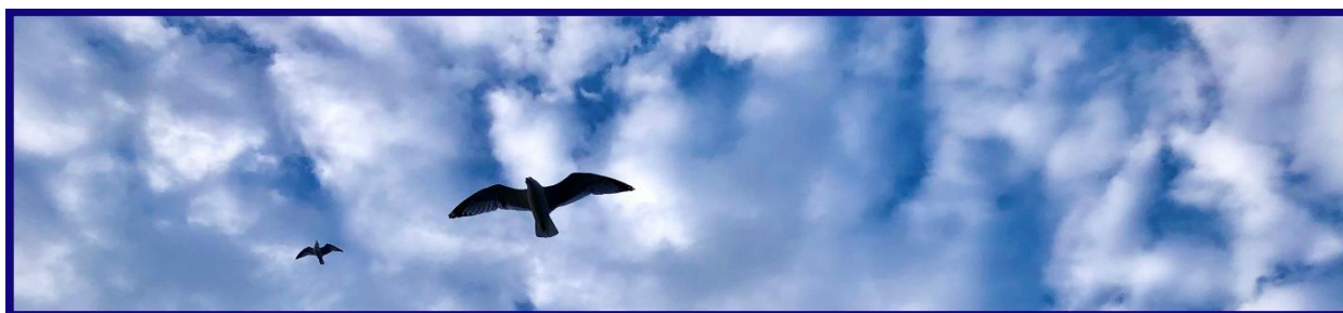
This beautiful shot is by Selina