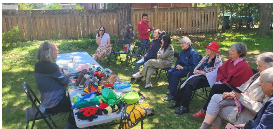
Captain Catalyst at a previous LUUC Bird and Bug Show