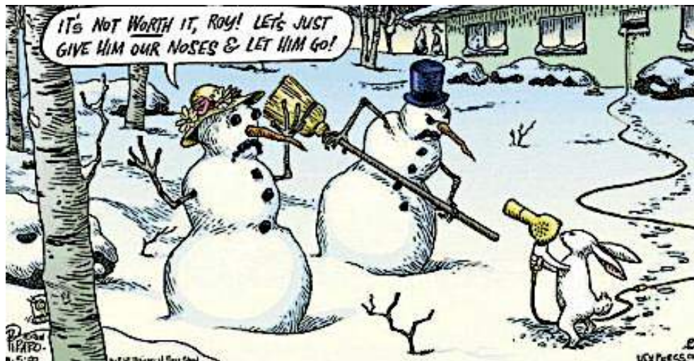
Let It Snow, Let It Snow, Let It Snow...